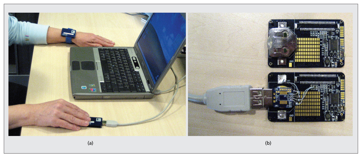
Figure 3. A user identification application using BCC: a) identification setup for user authentication on a laptop using a BCC identification tag on the user's wrist and a USB connected BCC transceiver; b) inside of the BCC transceivers with 3 cm × 5 cm electrodes. The upper transceiver, as worn at the wrist in a), is battery fed. The lower device additionally implements a USB connection, which is also used as power supply.

and one of the devices of the already established network.